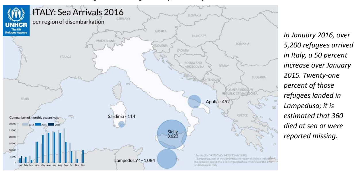
Figure 2 Number and Location of Refugees Arriving at Italy, January 2016

Source: United Nations High Commissioner for Refugees, "Refugees/Migrants Emergency Response—Mediterranean—Regional Overview," 2016.